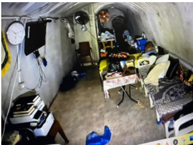
Sinwar's well-equipped tunnel hide-out