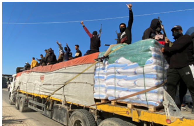
Aid Trucks looted by Hamas

In so doing, Israel goes above and beyond what any other military has ever done, does so against its own interests, and demonstrates actual concern for Gazan civilians. In contrast: