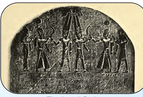
The Israel Stele

FACT: Just as no land of Palestine existed when Jesus was born, no people known as Palestinians existed. The Jews are the indigenous people of the land.