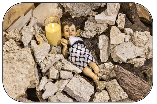
December 2023 "Jesus in the Rubble," Bethlehem